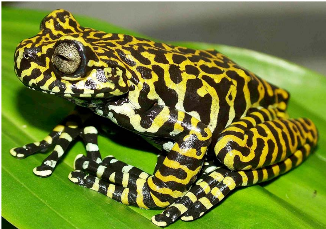
Figure 1. Adult female Hyloscirtus tigrinus (ICN 54635, 62.9 mm SVL) from Laguna de la Magdalena, department of Cauca, Colombia.

recorded only at the type locality; however while carrying out field work at Laguna de La Magdalena, Puracé Natural National Park, department of Cauca, the senior author collected an additional specimen of H. tigrinus (Figure 1), extending the geographic and altitudinal range of the species.