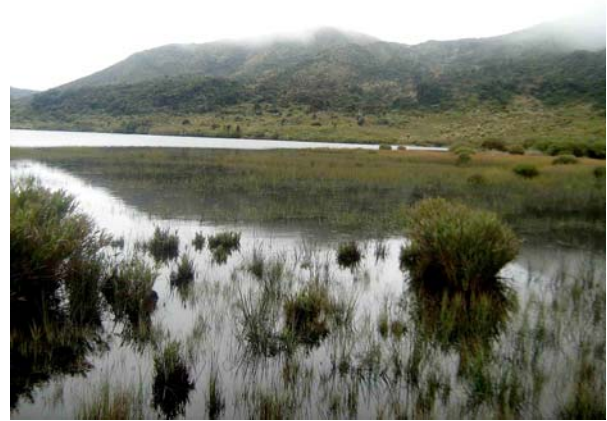
Figure 2. (A) General aspect of the Laguna de la Magdalena, and (B) of the habitat where Hyloscirtus tigrinus was found.

of upper montane Andean forest next to a small stream (Mueses-Cisneros and Anganoy-Criollo 2008).