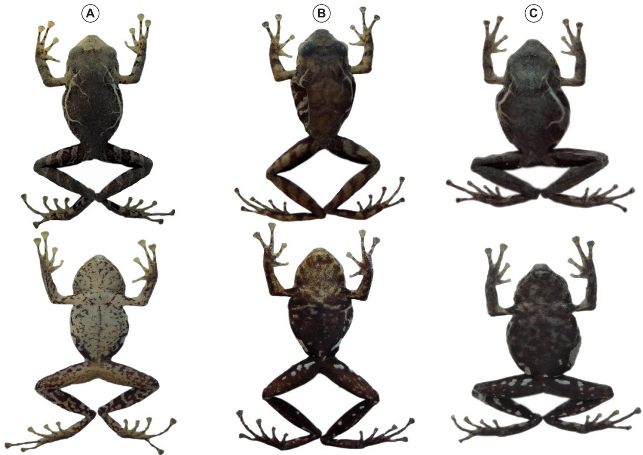
FIGURE 2. Dorsal and ventral views of adult Pristimantis muscosus showing variation in dorsal and ventral patterns. From left to right: A) DHMECN 2519, B) DHMECN 2518, C) DHMECN 2521 (See Appendix I for locality data).